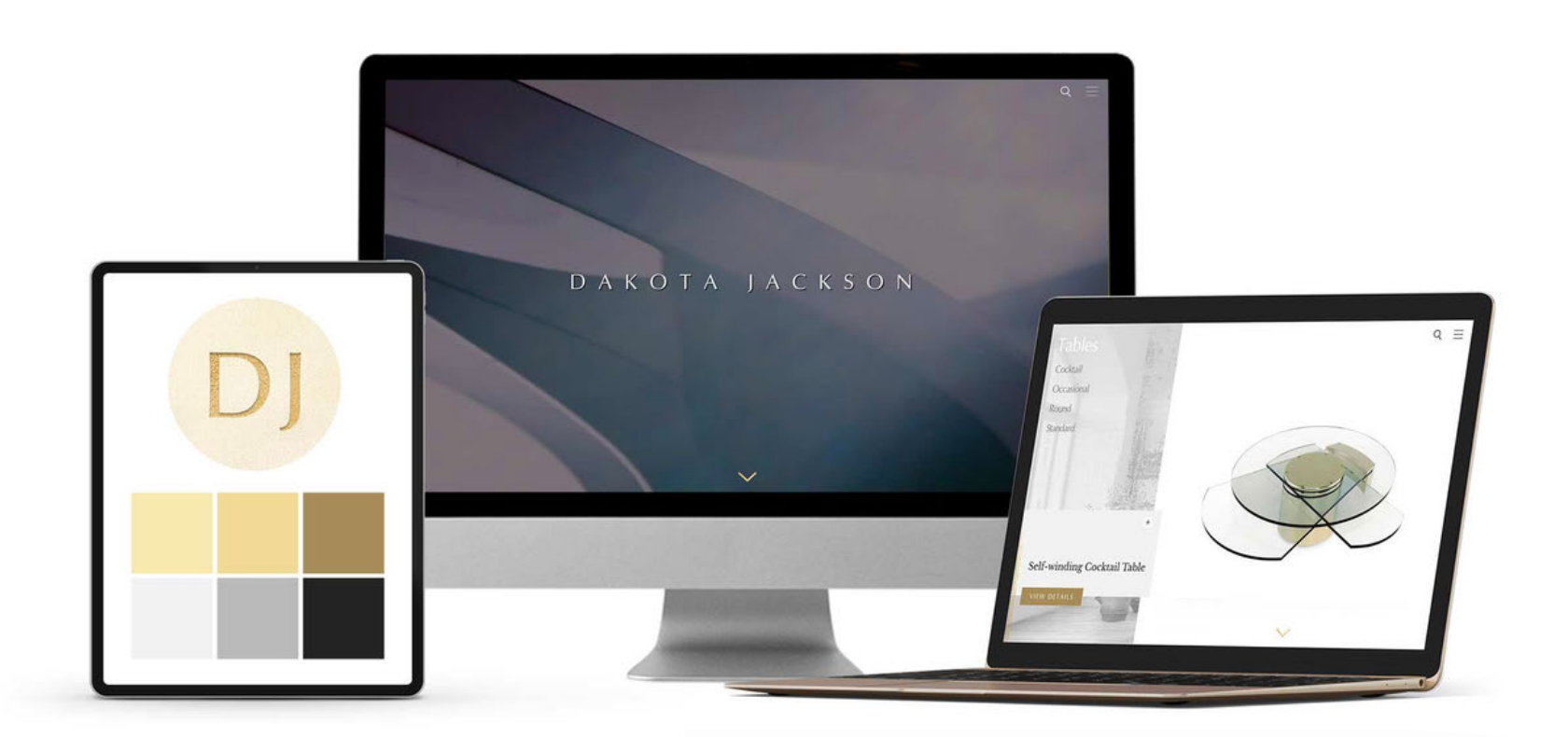
Client Showcase: Dakota Jackson Furniture